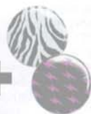
ZEBRA AND LIGHTNING PRINTS: BADGES, $5 FOR A SET OF THREE, FROM FUNCDEKO