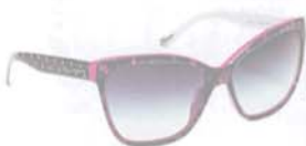
LACE AND POLKA DOTS: SUNGLASSES, FROM DOLCE & GABBANA

Clashing printed accessories is a quick, fun way to spice up a basic outfit. The trick is to keep them to a similar colour palette, or opt for similar-looking prints (think polka dots and leopard spots).