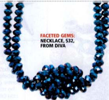
FACETED GEMS: NECKLACE, $32, FROM DIVA