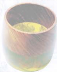
WOOD: BANGLE, $14.90, FROM H&M