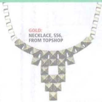
GOLD: NECKLACE, $56, FROM TOPSHOP

You can have too much of a good thing: overdose on bling and it's too hip-hop; overdose on wooden/beaded pieces and it's too hippie. Go for statement pieces of opposing textures with a common element — like geometric styles or gold accents — and get the proportions just right.