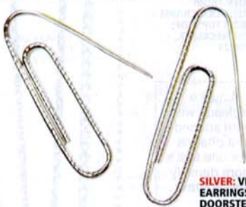
SILVER: VERITAS BY CARRIE K. EARRINGS, $232, FROM DOORSTEP LUXURY