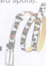
ANIMAL PRINT: BELT, $25, FROM FEMME X