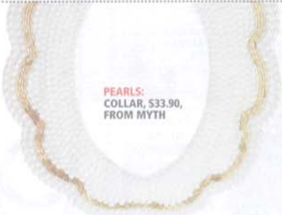
PEARLS: COLLAR, $33.90, FROM MYTH