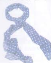
POLKA DOTS: SCARF, FROM H&M