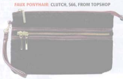
FAUX PONYHAIR: CLUTCH, $66, FROM TOPSHOP