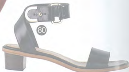
70 Cotton blend skirt, $119, from Hansel. 71 Wool blend tulip skirt, $259, from Hansel. 72 Viscose blend skirt, $200, from Max Tan. 73 Polyester skirt, $73.83, from GG<5. 74 Woonhung beaded wood necklace, $149 (for a set), from Lauren Jasmine. 75 Carrie K gold plated necklace with amethyst, black gold plated necklace with black agate and rose gold plated necklace with blue agate, $748 each, from The Society Of Black Sheep. 76 Tweed jacket, $579, from Alldressedup. 77 Cropped cotton jacket, $57.70, from Mu. 78 Leather shoulder bag with metal charm, $399, from Alldressedup. 79 Ponyhair clutch, $220, from Depression. 80 Leather sandals, $239, from Raoul.