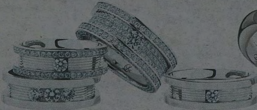
LVC Promise wedding rings, from $1,599 each, from Love & Co