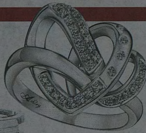
Ashley Isham Love Divine ring, from $1,538, from Lee Hwa Diamond Promenade