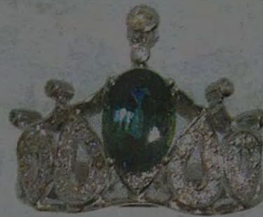
Tiara ring with blue-green sapphire in white gold with diamonds, from $5,500, from Simone Jewels