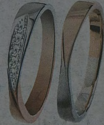
Wykidd for Soo Kee rose and white gold wedding bands, from $599 (man's) and from $639 (woman's), from Soo Kee Jewellery