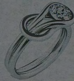
Forevermark Encordia solitaire ring in white gold, from $948, from Lee Hwa Diamond Promenade