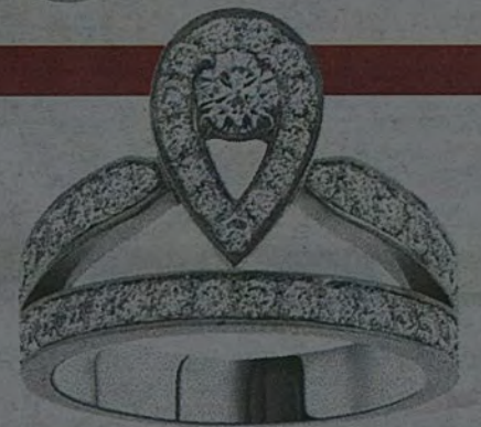
Josephine Tiara ring with brilliant-cut diamond in rhodium-plated white gold and diamonds, from $14,300, from Chaumet