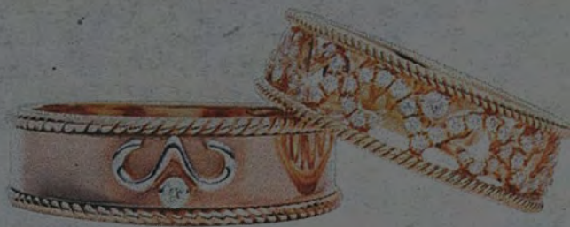
Royale wedding bands with diamonds in rose gold, from $3,300 per pair, from Ling Fine Jewellery