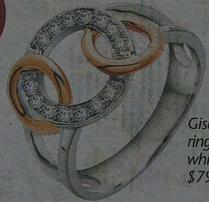
Gisella diamond ring in rose and white gold, from $792, from TianPo

What kind of bride are you? Just choose your rings accordingly, says IMRAN JALAL