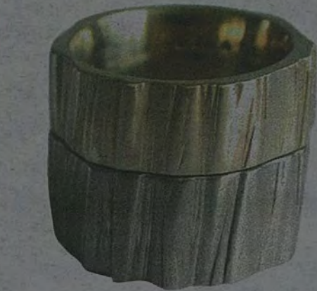
Champagne and grey gold rings with bark texture, from $3,000 per pair, from Argentum