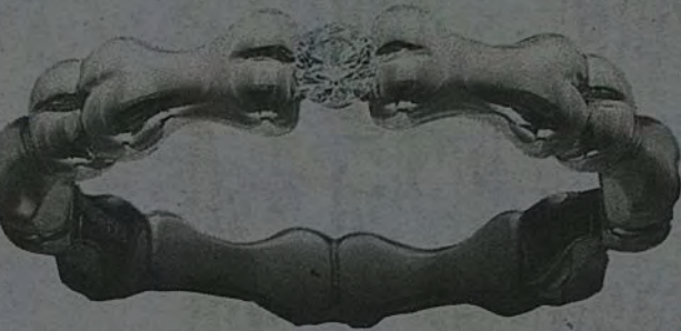
Till Death Do Us Part ring, from $7,100, from Solange Azagury-Partridge