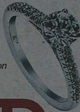
Mini Isabella ring, price upon request, from Larry Jewelry