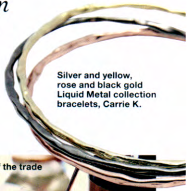
Silver and yellow, rose and black gold Liquid Metal collection bracelets, Carrie K.