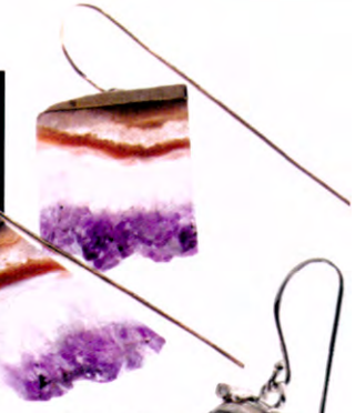
Amethyst Raw collection sliced earrings, Carrie K.