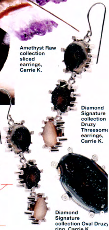
Diamond Signature collection Druzu Threesom earrings, Carrie K.